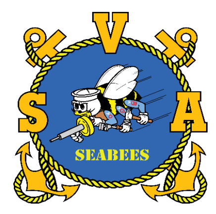
Search the NSVA Website for more contact information and updates at <u>www.nsva.org</u> See you at the National Convention

The Can Do Magazine is committed to honoring the NSVA members on their passing by listing them in the Final Salute pages. Please notify the SVA National Secretary at <a href="mailto:nsvasec@gmail.com">nsvasec@gmail.com</a> or by calling 1-203-843-5513 of a members passing as soon as possible. Be sure to include the members Life Member number (if applicable) and their Island/Unit affiliation. To view more deceased Seabee names go to the Seabee Historical Foundation website at <a href="mailto:www.seabeehf.org">www.seabeehf.org</a>