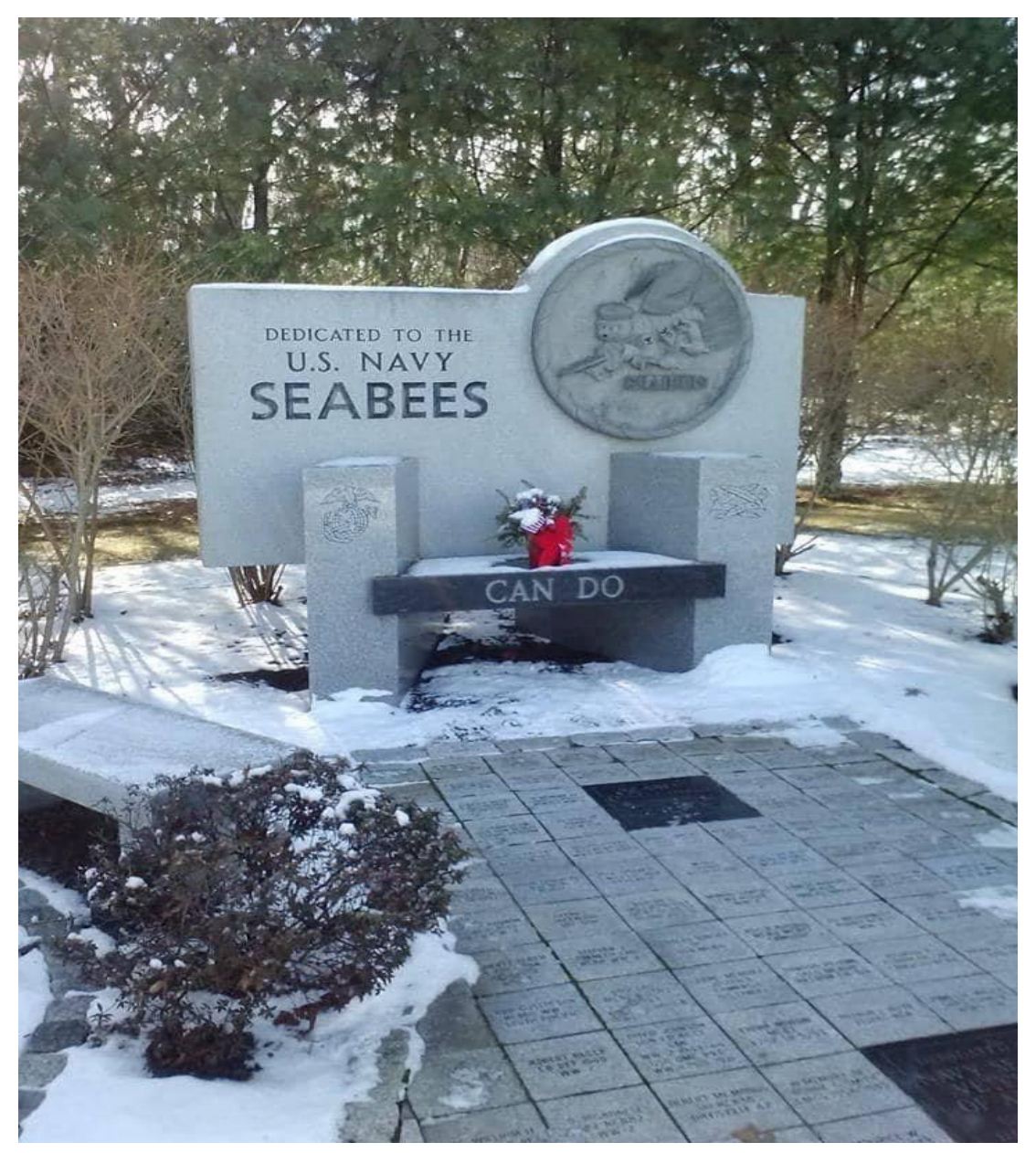
Volume 32, Edition 4, Winter 2022-23