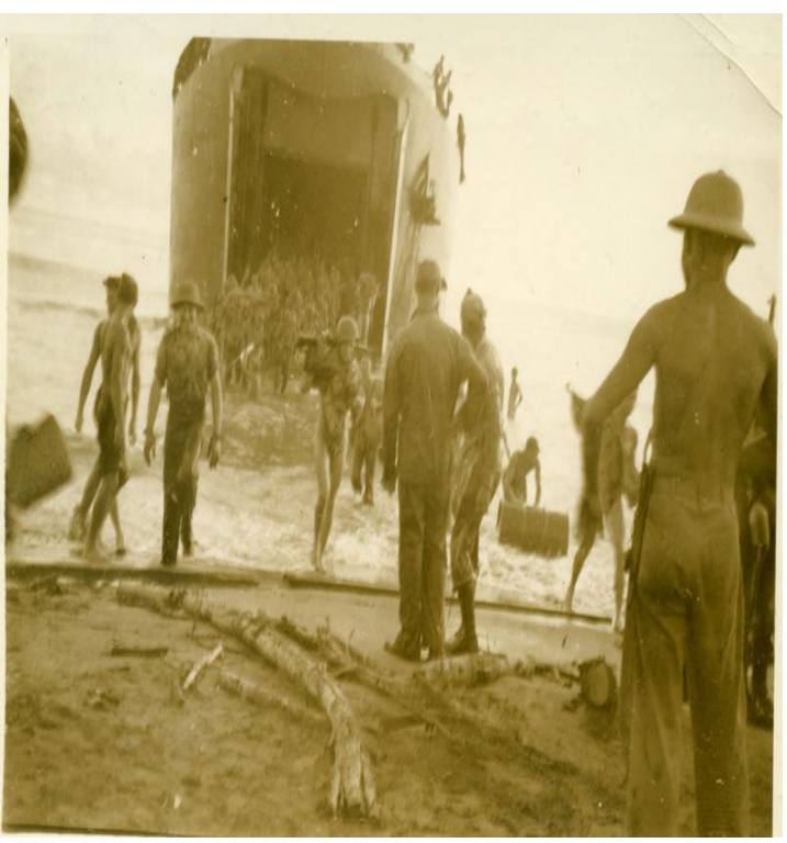
Unloading the 164 Infantry, Christmas Morning 1943