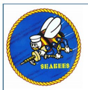
Celebrate The Seabees 81st Birthday