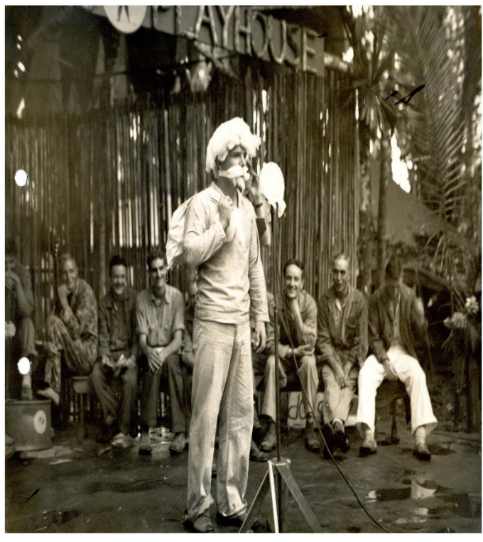
6th Special Christmas Show 1943